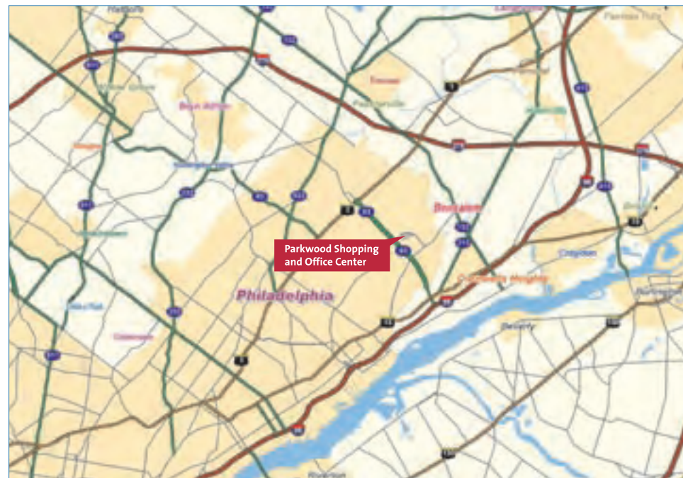
Parkwood Shopping and Office Center Academy and Byberry Roads Philadelphia, PA 19154