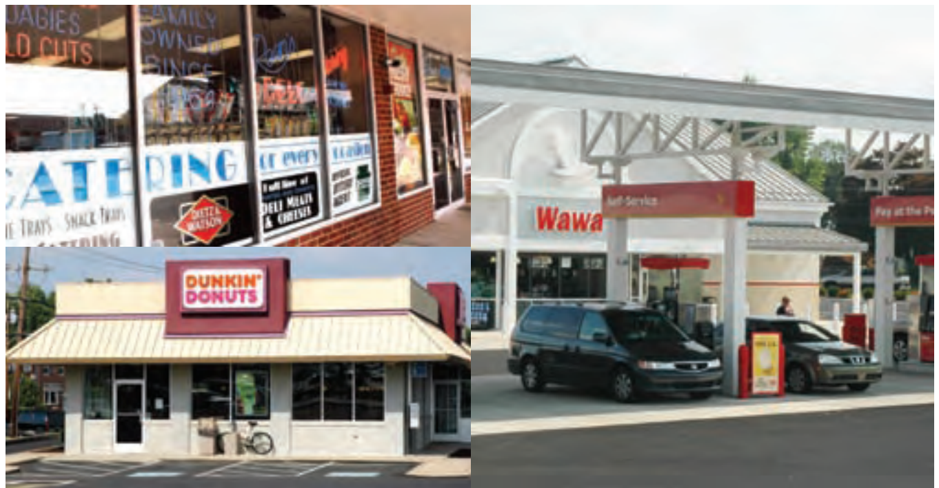
Parkwood Shopping and Office Center Academy and Byberry Roads Philadelphia, PA 19154