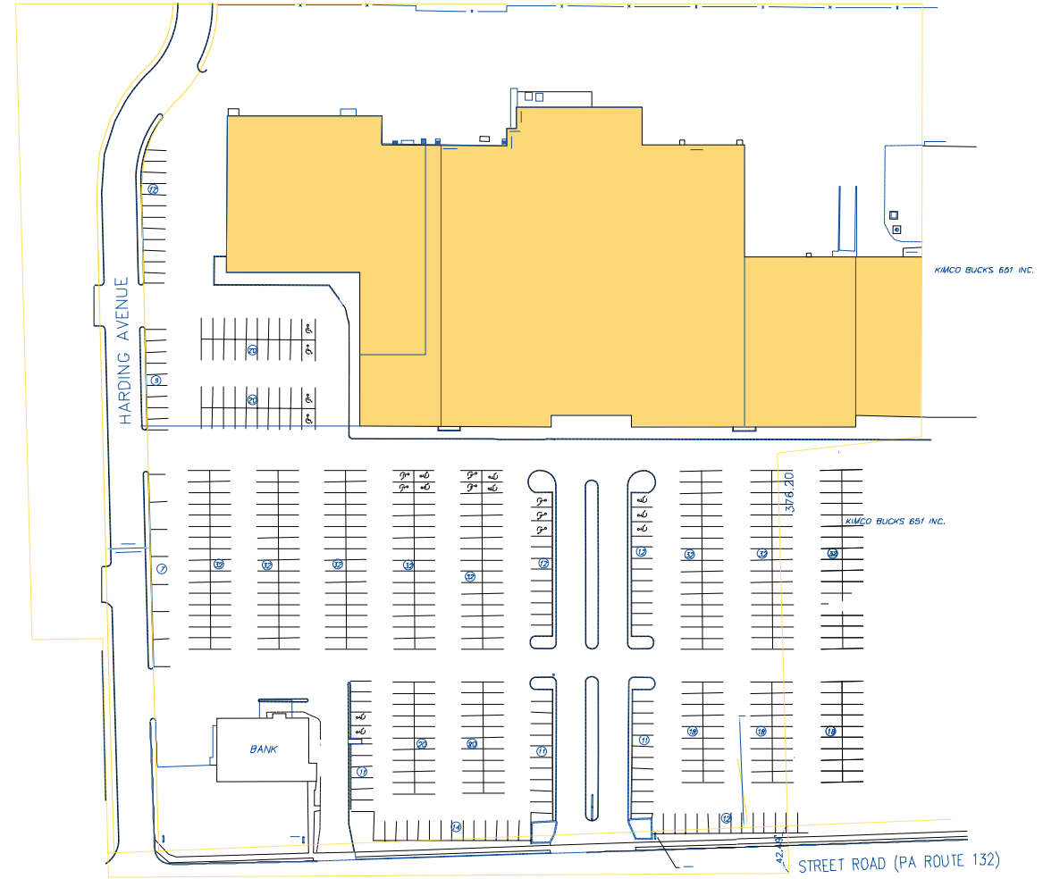
Bucks Crossing Street Road (Rt 132) and Bustleton Pike (Rt 532) Feasterville, PA 19053