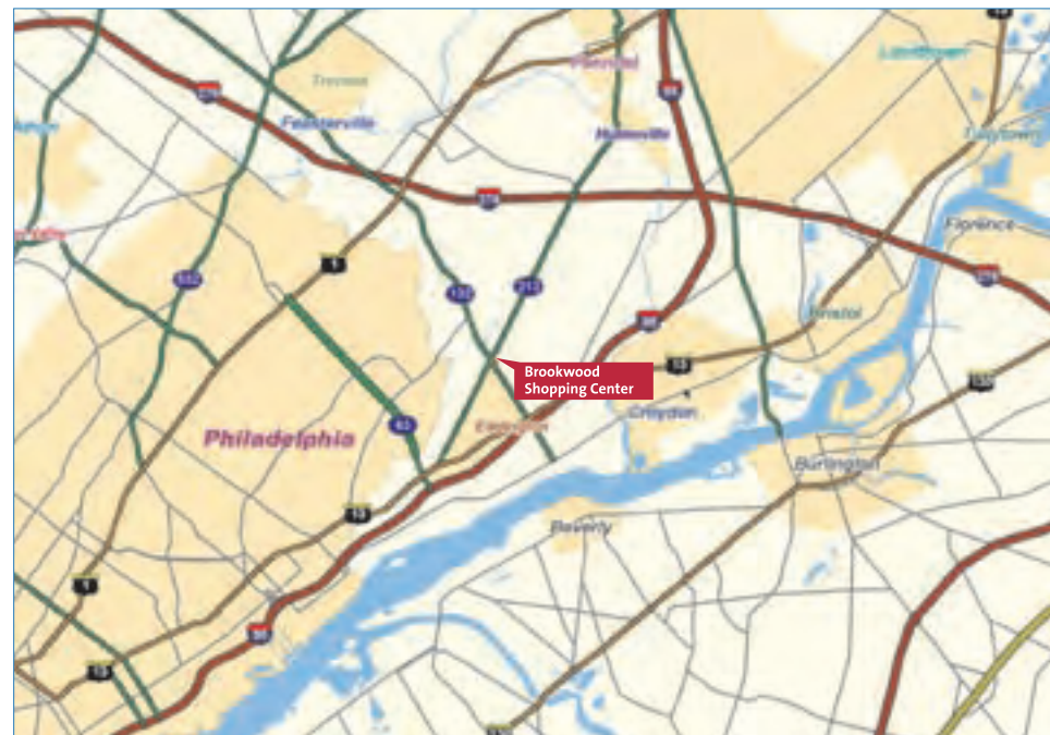
Brookwood Shopping Center Street Road (Route 132) and Hulmeville Road (Route 513) Bensalem, PA 19020